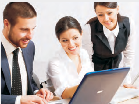
Enhanced Multimedia Experience