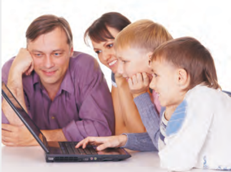
Quick & Easy Setup